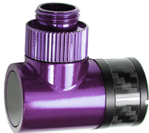
Rotary Fitting is shown for Representation only and not included for the price