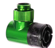
Rotary Fitting is shown for Representation only and not included for the price