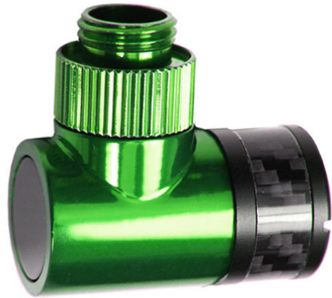
Rotary Fitting is shown for Representation only and not included for the price