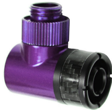
Rotary Fitting is shown for Representation only and not included for the price