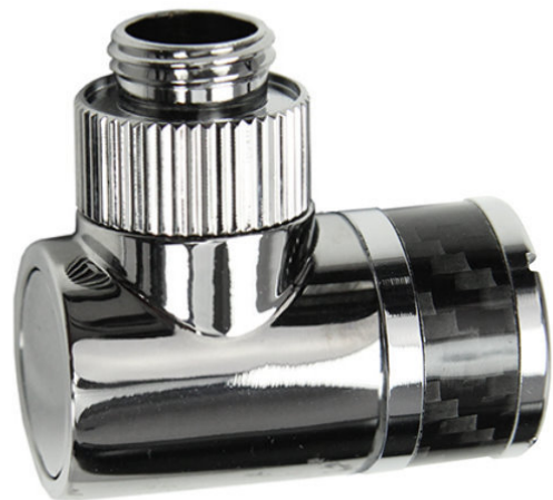
Rotary Fitting is shown for Representation only and not included for the price