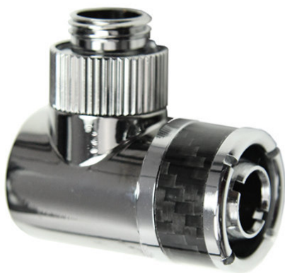
Rotary Fitting is shown for Representation only and not included for the price