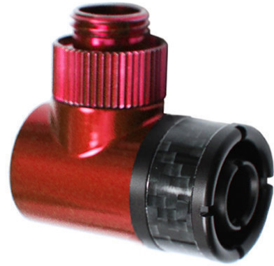
Rotary Fitting is shown for Representation only and not included for the price