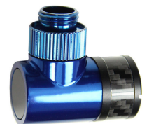
Rotary Fitting is shown for Representation only and not included for the price.