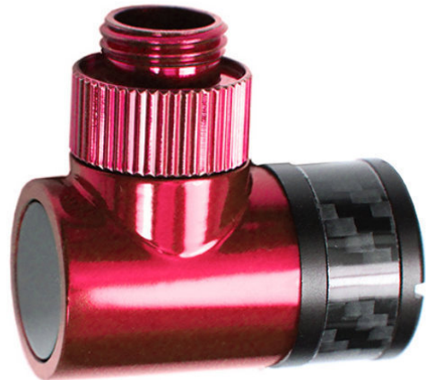
Rotary Fitting is shown for Representation only and not included for the price