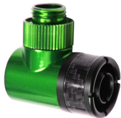
Rotary Fitting is shown for Representation only and not included for the price