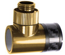
Rotary Fitting is shown for Representation only and not included for the price.