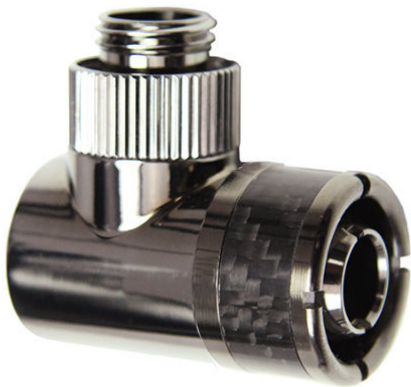
Rotary Fitting is shown for Representation only and not included for the price