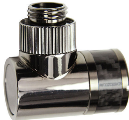
Rotary Fitting is shown for Representation only and not included for the price