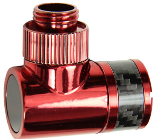
Rotary Fitting is shown for Representation only and not included for the price