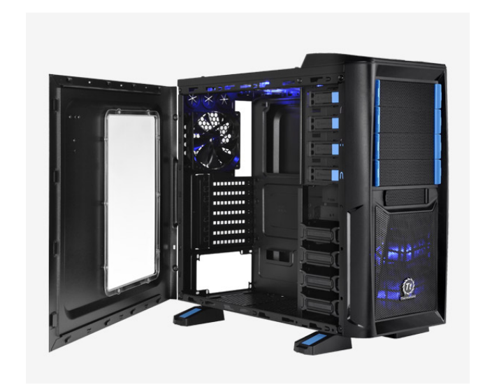
E-Sport Design The black metal meshed and glossy detailed front panel combined with a large transparent side window panel, it hard not to leave your eye off it.

Thermaltake Chaser A41 mid-tower chassis The new member of Chaser hardcore gaming series, designed for gamers to gear with the latest gaming component, offering not only style and personality but an exceptional combination of cooling, performance and expandability for gaming purists to ensure true enjoyment while in or out of the game.