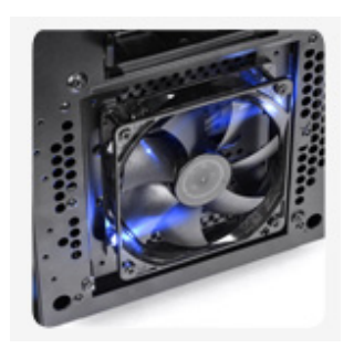
Front Intake 120mm black frame fan