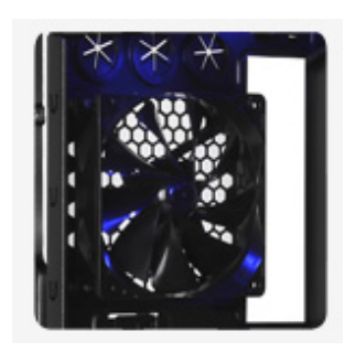
Rear Exhaust 120 mm black fan with Blue LED