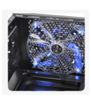
Top exhausted 200mm fan with Blue LED