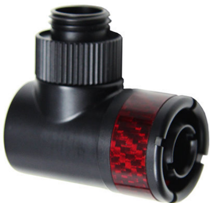
Rotary Fitting is shown for Representation only and not included for the price