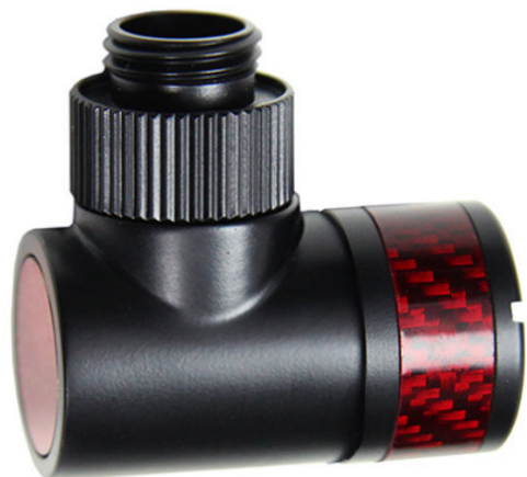
Rotary Fitting is shown for Representation only and not included for the price