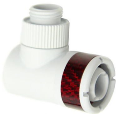
Rotary Fitting is shown for Representation only and not included for the price