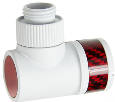
Rotary Fitting is shown for Representation only and not included for the price