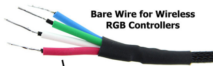
Bare Wire for Wireless RGB Controllers