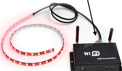
RGB Controller Not Included