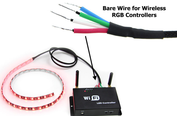
RGB Controller Not Included