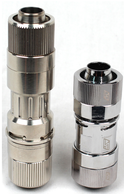
Height compared: Left, other brand - Right, Swiftech QC-NS (QC-NS shown with optional 3/4x1/2" Compression Fitting Caps)

This radically different design concept has two direct consequences: