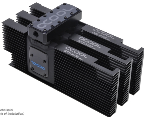
Montagebeispiel (Example of installation)