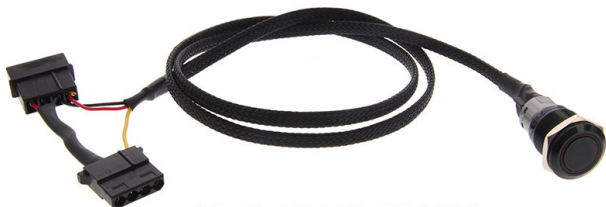
Optional Pro-Solder Latching Cable Installed