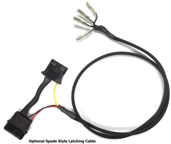
Optional Spade Style Latching Cable