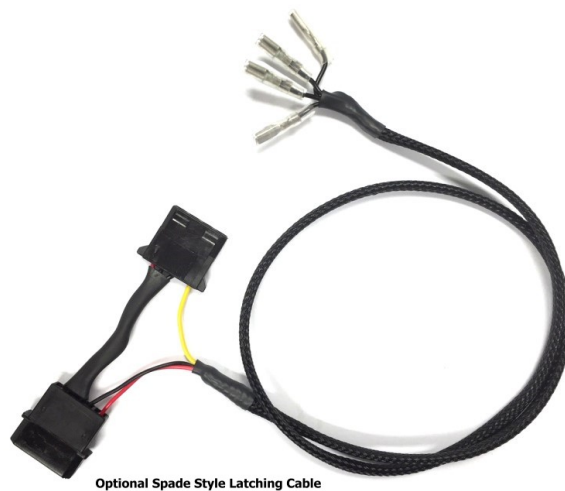
Optional Spade Style Latching Cable