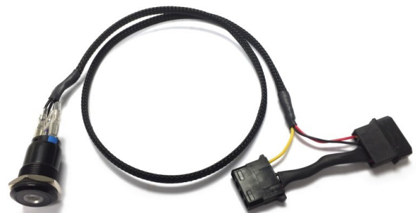
Optional Spade Style Latching Cable Installed