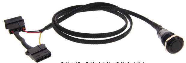
Optional Pro-Solder Latching Cable Installed