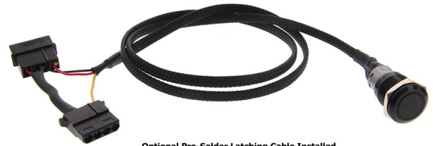
Optional Pro-Solder Latching Cable Installed