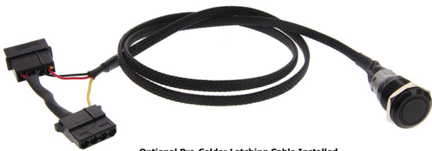
Optional Pro-Solder Latching Cable Installed