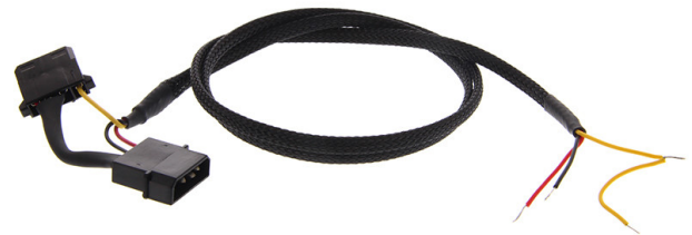
Optional Pro-Solder Latching Cable