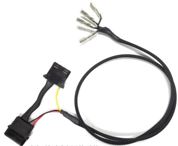
Optional Spade Style Latching Cable