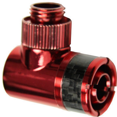
Rotary Fitting is shown for Representation only and not included for the price