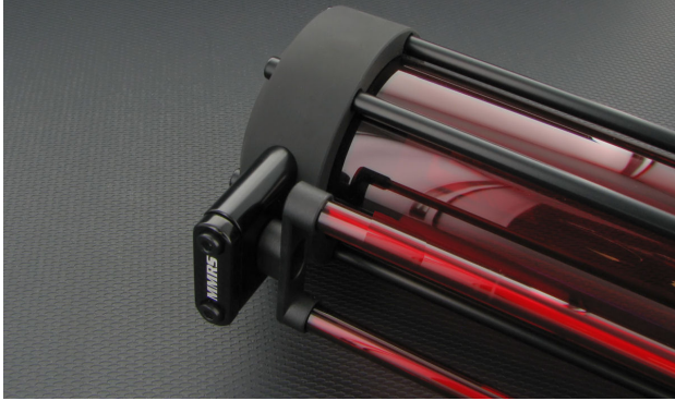
TYPICAL MMRS DUAL BULB CCFL INSTALLATION ON 25MM RESERVOIR MOUNTS.