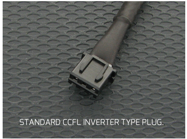
STANDARD CCFL INVERTER TYPE PLUG.