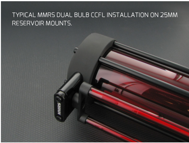
TYPICAL MMRS DUAL BULB CCFL INSTALLATION ON 25MM RESERVOIR MOUNTS.