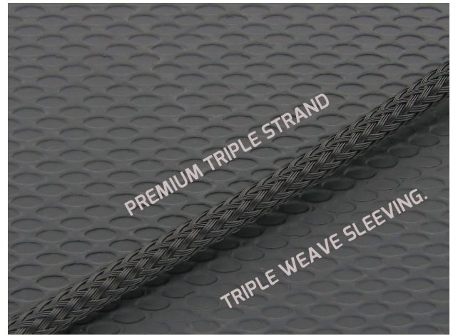
PREMIUM TRIPLE STRAND