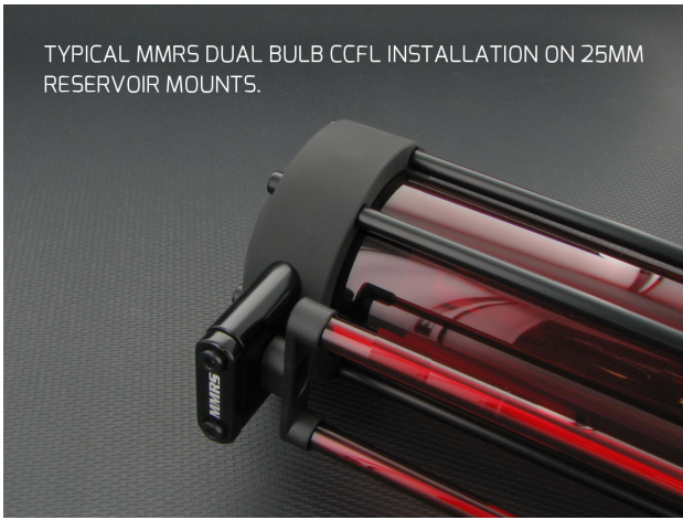
TYPICAL MMRS DUAL BULB CCFL INSTALLATION ON 25MM RESERVOIR MOUNTS.