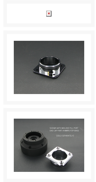
SHOWN MOUNTED TO A MOLDED FILL PORT END CAP PART # MMRS-FDP-BASE FOR ILLUSTRATION PURPOSES. OTHER MODULAR PARTS SOLD SEPARATELY.