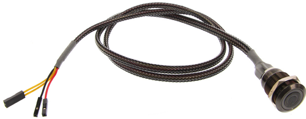
Shown With Optional Cable