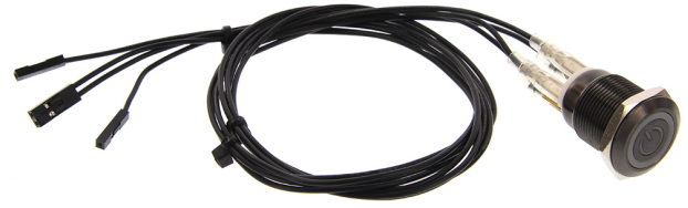
Shown With Optional Cable