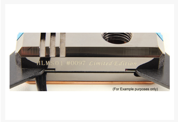
(For Example purposes only)