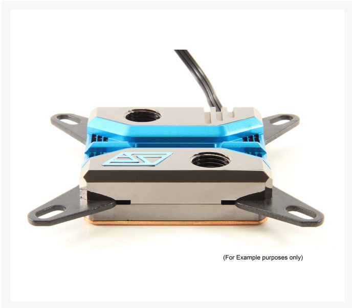
(For Example purposes only)