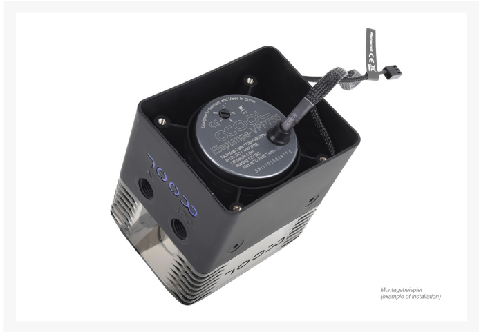
Montagebeispiel (example of installation)