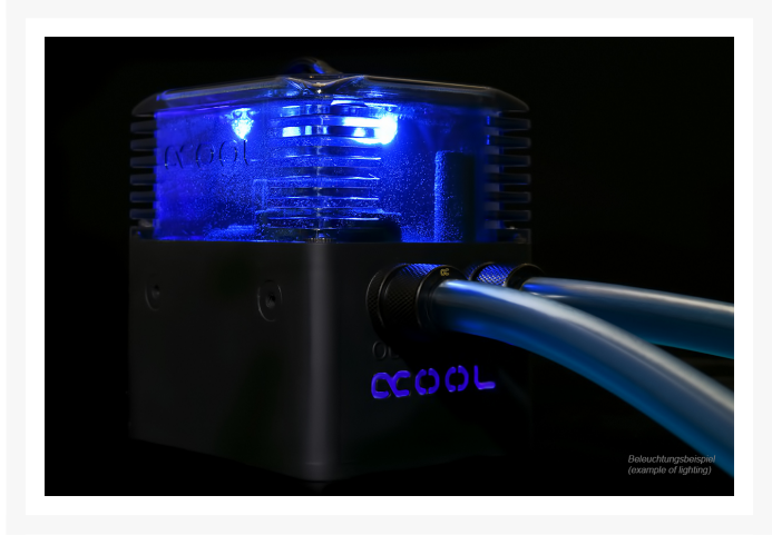
Beleuchtungsbeispiel (example of lighting)