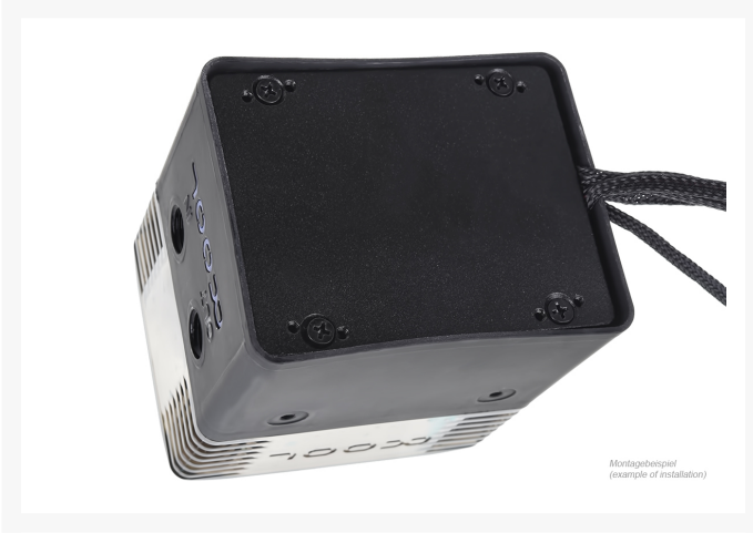
Montagebeispiel (example of installation)