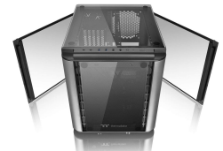
4mm Tempered Glass x 4 (Left, Right, Top, Front)