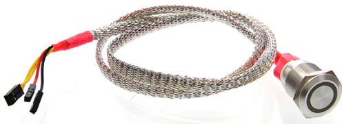
Shown With Optional Cable