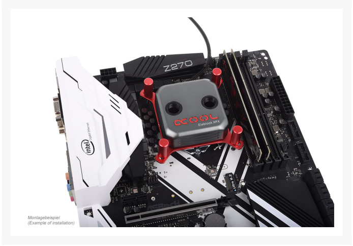
Montagebeispiel (Example of installation)