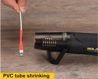
PVC tube shrinking