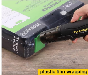
plastic film wrapping