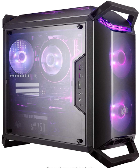
Case does not include full-system build or two top 120mm fans.