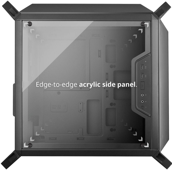
Edge-to-edge acrylic side panel.