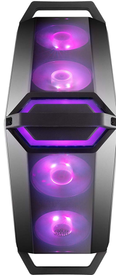
Case does not include two top 120mm fans.