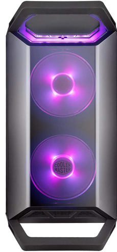
Two pre-installed 120mm RGB LED fans behind the front panel.