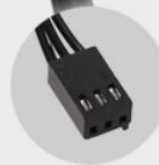
Lighting strip power supply interface

D-type power supply interface (2): Connect to PC power supply