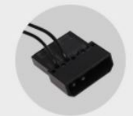
D-type power supply interface