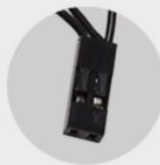
PC power switch jumper female interface