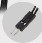
PC power switch jumper male interface