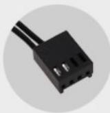
PWM interface/Speed detection