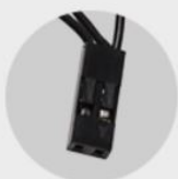
PC power switch jumper female interface