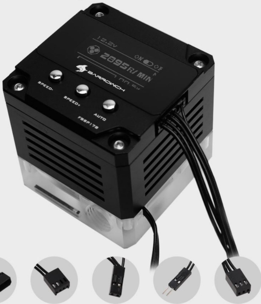
D-type power supply interface