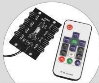
P/N: DK201 8 WAY REMOTE CONTROLLER