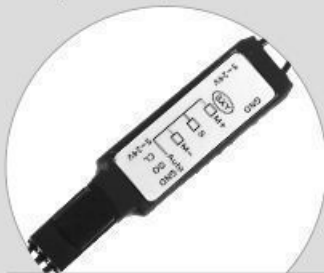
P/N: ARSKZQ MANUAL CONTROLLER

LRC full-color RGB lighting control system 2.0 includes BARROW 2.0 version manual controller, 8 way remote controller. Compatible with all BARROW' S 2.0 version of the RGB light-based components and other independent products and built-in lighting components products.