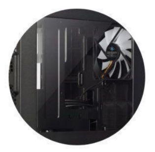
Showcase your hardware

Excellent water cooling support with space for up to four radiators simultaneously.