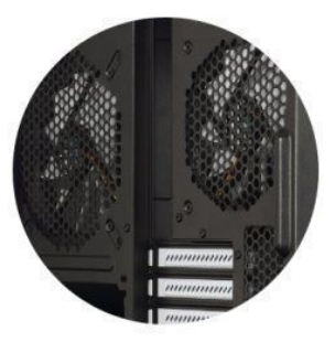
3x Silent Fans included

Featuring a window side panel to show off your set up in style