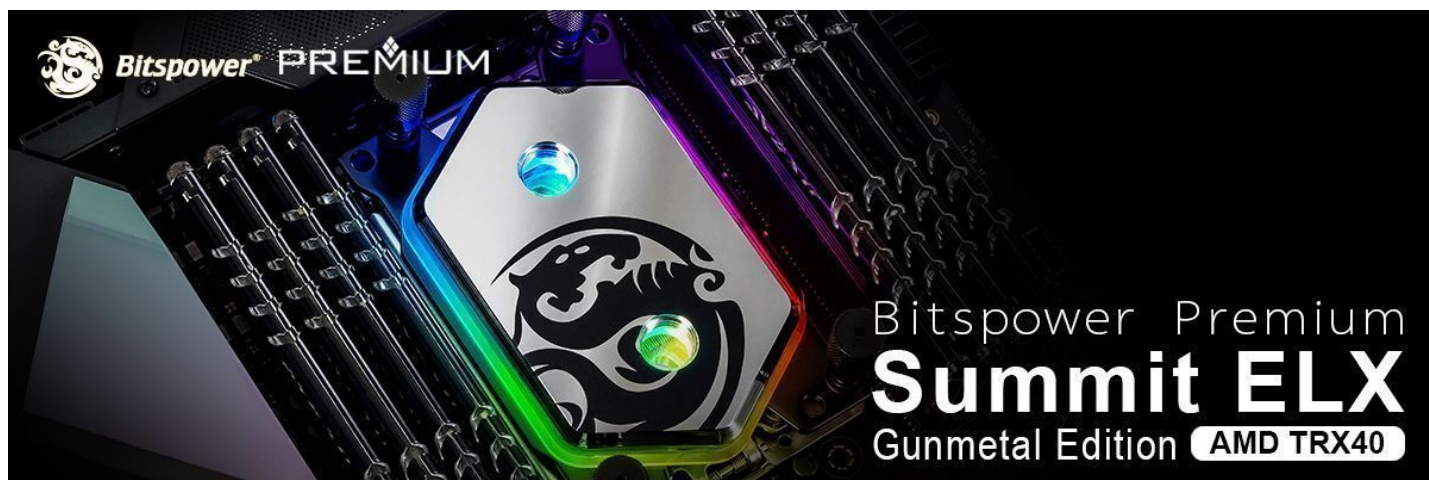
Bitpower Premium Summit ELX Gunmetal Edition ( AMD TRX40 )

With high processing power comes the need for heat management. In order to keep your AMD 3rd Gen Ryzen Threadripper processor under optimum working conditions, Bitpower has developed a water block for the socket sTRX4 with the Bitpower Premium Summit ELX series. Additionally, it's also compatible with previous Ryzen Threadripper series.