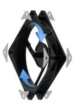
Enhanced Fan Fame Enhanced frame structure, reducing turbulent flow noise increase efficiency.