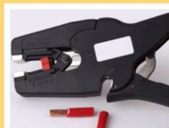
B. The small handle can be used to cut the thread.

Note: When stripping or cutting wires, do not put your fingers between the two handles.