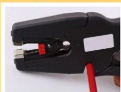
A. Place the wire in the cutting line, Wire inward as far as possible.