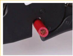
Wire cutter for multiple stranded wire cables up to 10 mm 2