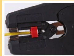
Steel clamping jaws avoid skidding of the cable