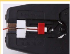
Precise stripping from 0.03 to 10 mm 2 without readjustment