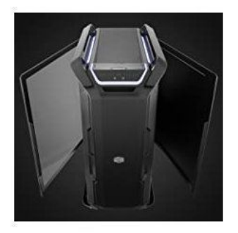
Curved Tempered Glass Side Panel

A lightly-tinted tempered glass side panel, with two curved edges, offer a wide view of the system build.