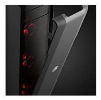
Flat Radiator Brackets

A lightly-tinted tempered glass side panel, with two curved edges, offer a wide view of the system build.