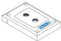
Water block with G \frac{1}{4} " connector