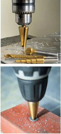
STEP DRILL BITS SAW DRILL BITS