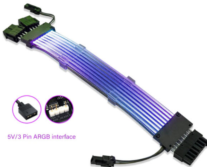
5V/3 Pin ARGB interface