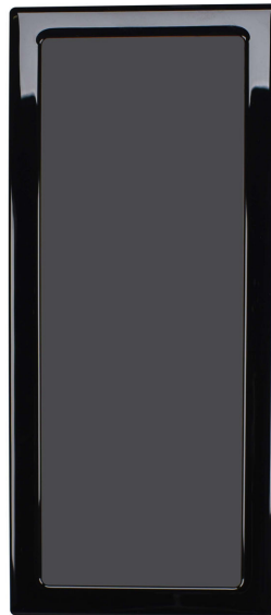
COOLER MASTER NR200P BOTTOM FILTER SKU 1091