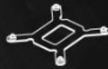
Retention Plate for LGA1700

Perfect for the Intel® Alder Lake processors up to 35W Thermal Design Point (TDP) with increased contact surface area, allowing for more heat to be dissipated at a time.