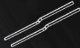
Copper Heat Pipes