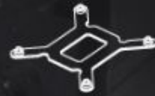
Retention Plate for LGA1700