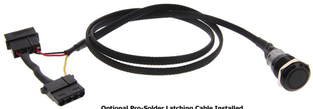
Optional Pro-Solder Latching Cable Installed