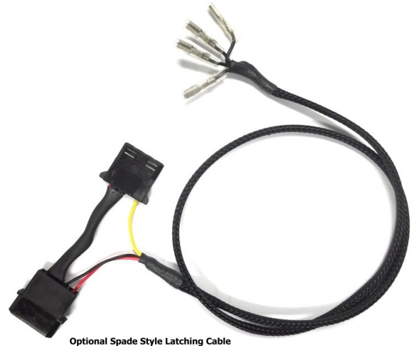
Optional Spade Style Latching Cable