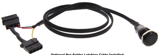
Optional Pro-Solder Latching Cable Installed